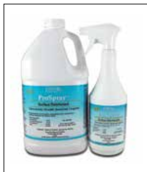
ProSpray™ Ready-to-Use Surface Disinfectant/Cleaner