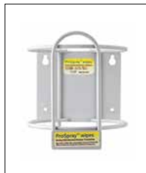
ProSpray™ wipes Canister Bracket Fits All Canisters