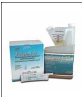
ProSpray C-60™ Concentrated Surface Disinfectant/Cleaner