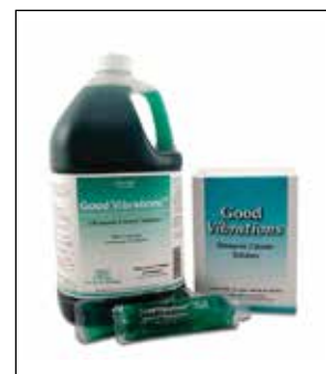
Good Vibrations™ Ultrasonic Cleaner Solution